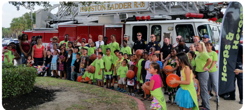
The North Houston District's events build relationships between law enforcement and the community.

Each year in October, the District hosts a National Night Out event as another way to build community and promote positive interaction with law enforcement.