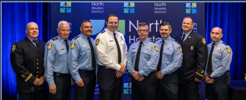
Houston Fire Department