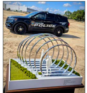
Art sculpture, Comm-Unity Rings, by artist Obi Grant will be featured.