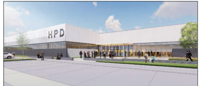
North Belt Police Station Public Entry rendering courtesy of HPD